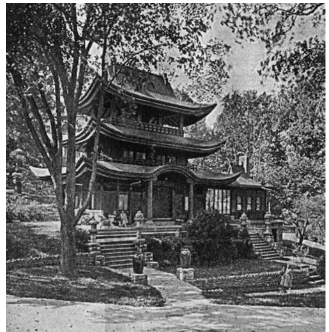
The Japanese pagoda sorority house at the National Park Seminary. During World War II, the Army seized the girls school to use as a place for soldiers to recuperate.

"My husband is a wooden boat restorer and sometimes looks at an old wreck of a boat and thinks this will never float again. In many ways, it's just like this project. But with enough care and effort and varnish, those boats go out on the water again, and maybe these buildings will survive another 100 years."